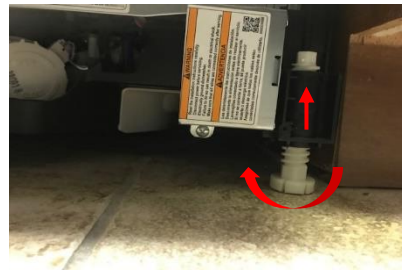
Spin the front legs 2~3 times to turn up the product.